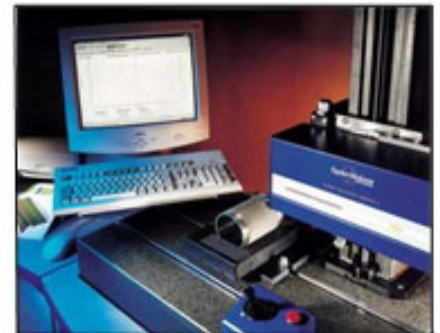
From Talysurf Series